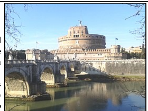
The Castel Sant'Angelo in Rome, with a bronze statue of St Michael the Archangel standing atop.

O God, who gave joy to the world through the resurrection of Thy Son, our Lord Jesus Christ, grant we beseech Thee, that through the intercession of the Virgin Mary, His Mother, we may obtain the joys of everlasting life. Through the same Christ our Lord. Amen.